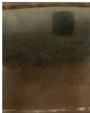
Untitled #559, Anne Fairchild