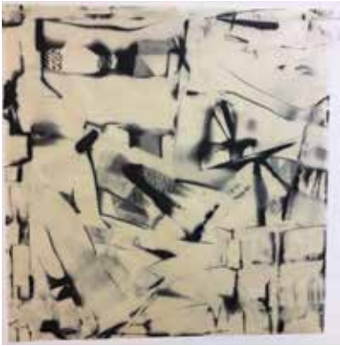
Square 1, Paula Roland