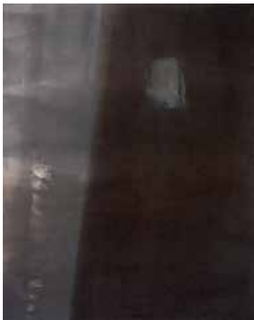
Untitled #554, Anne Fairchild