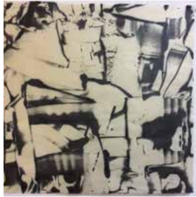
Square 2, Paula Roland