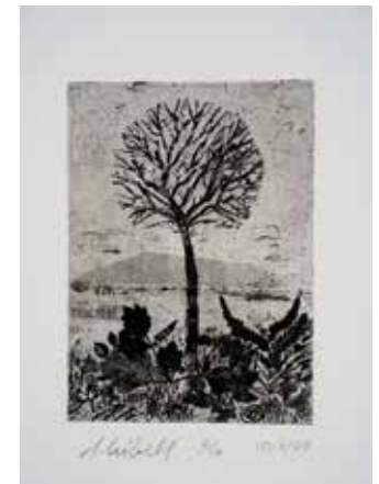
Untitled #501, Jerry Skibell